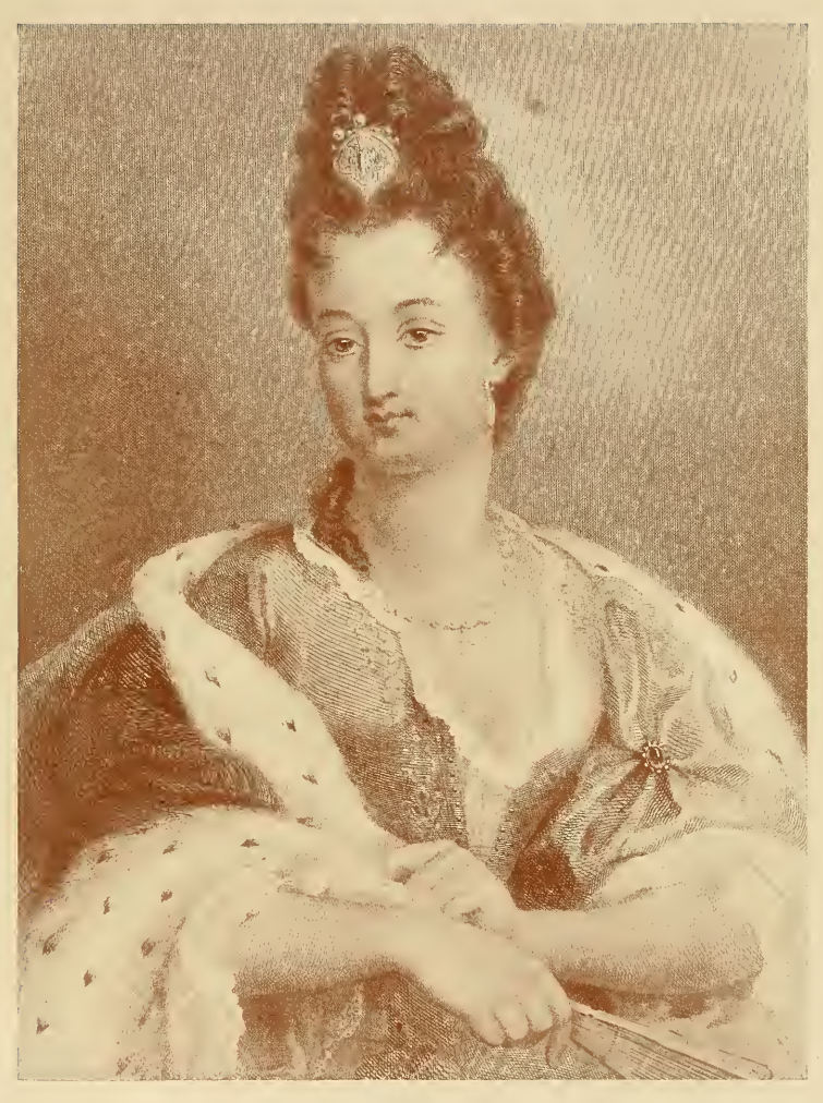
DUCHESSE DU MAINE After the portrait by Staal