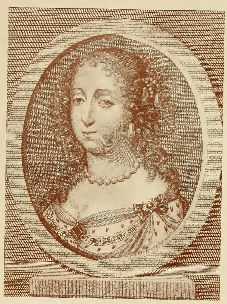
QUEEN ELEONORA OF SWEDEN From an old copper print