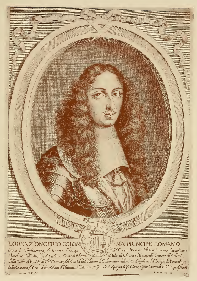
THE CONNETABLE COLONNA After the portrait by Giacomo Bichi