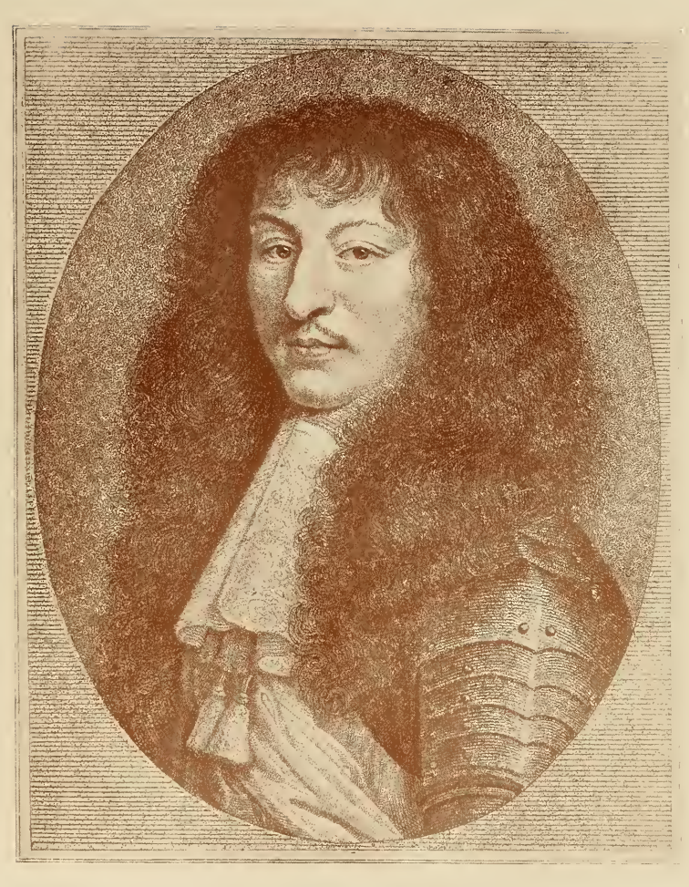
LOUIS XIV After a print by Nanteuil