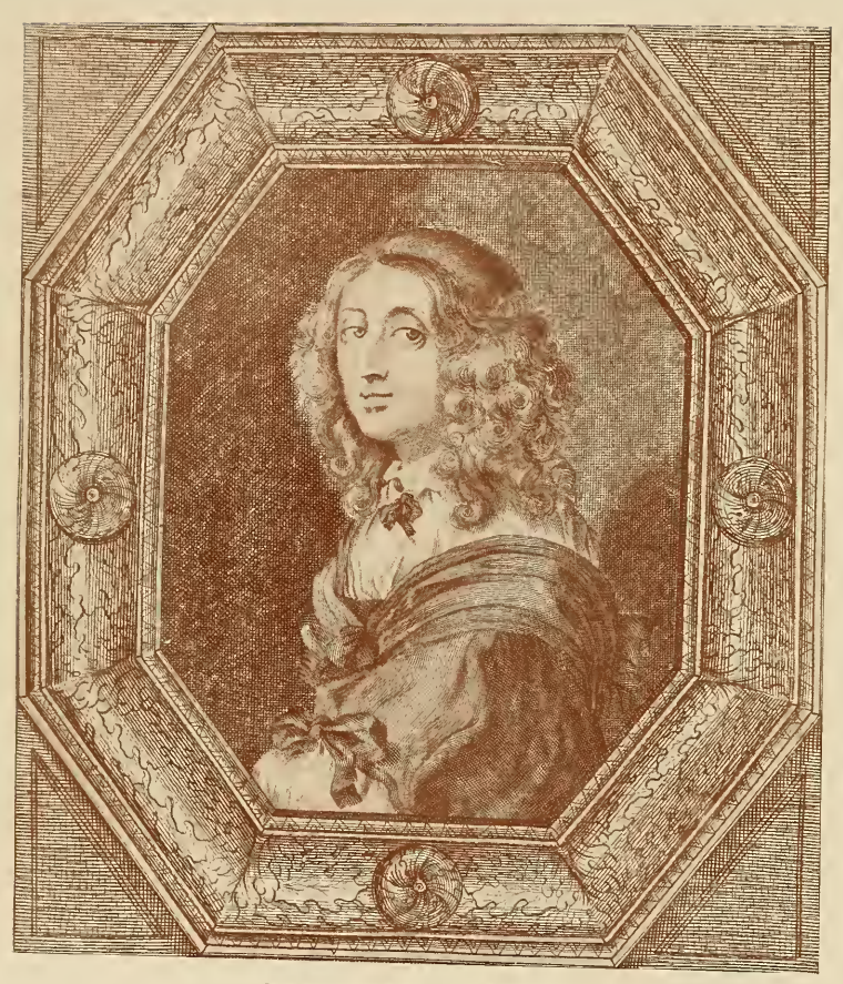
QUEEN CHRISTINA OF SWEDEN From an old copper print