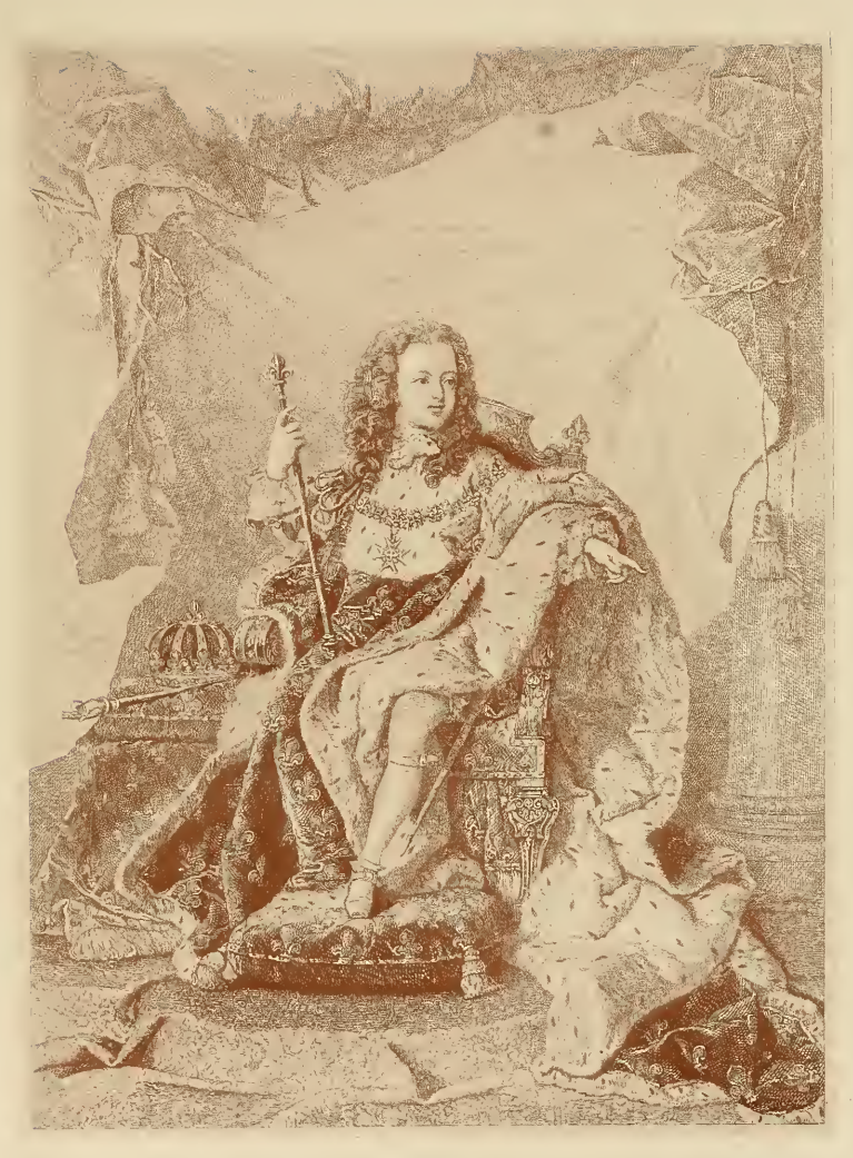
LOUIS XV. After the painting by Hyacinthe Rigaud