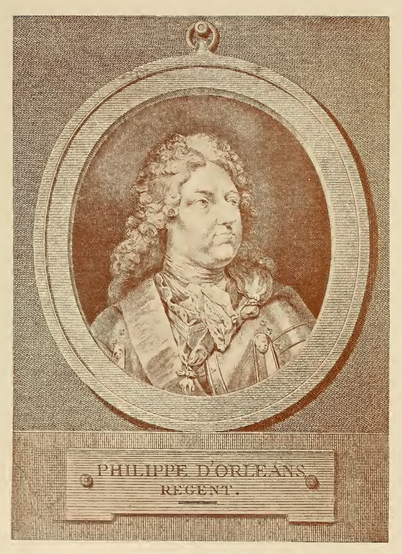
PHILIPPE DUC D'ORLÉANS From an old copper print