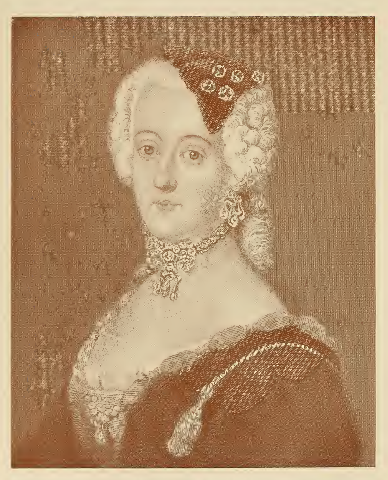
THE MARGRAVINE OF BAYREUTH From a steel engraving