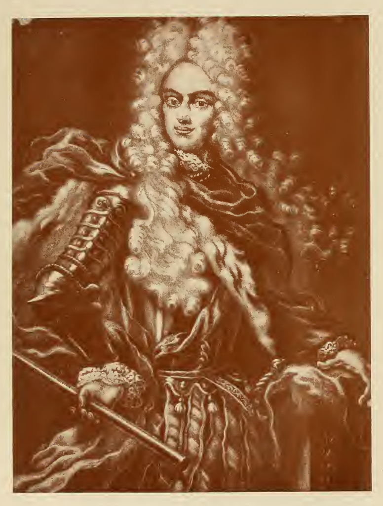
AUGUSTUS THE STRONG, KING OF POLAND From an old print