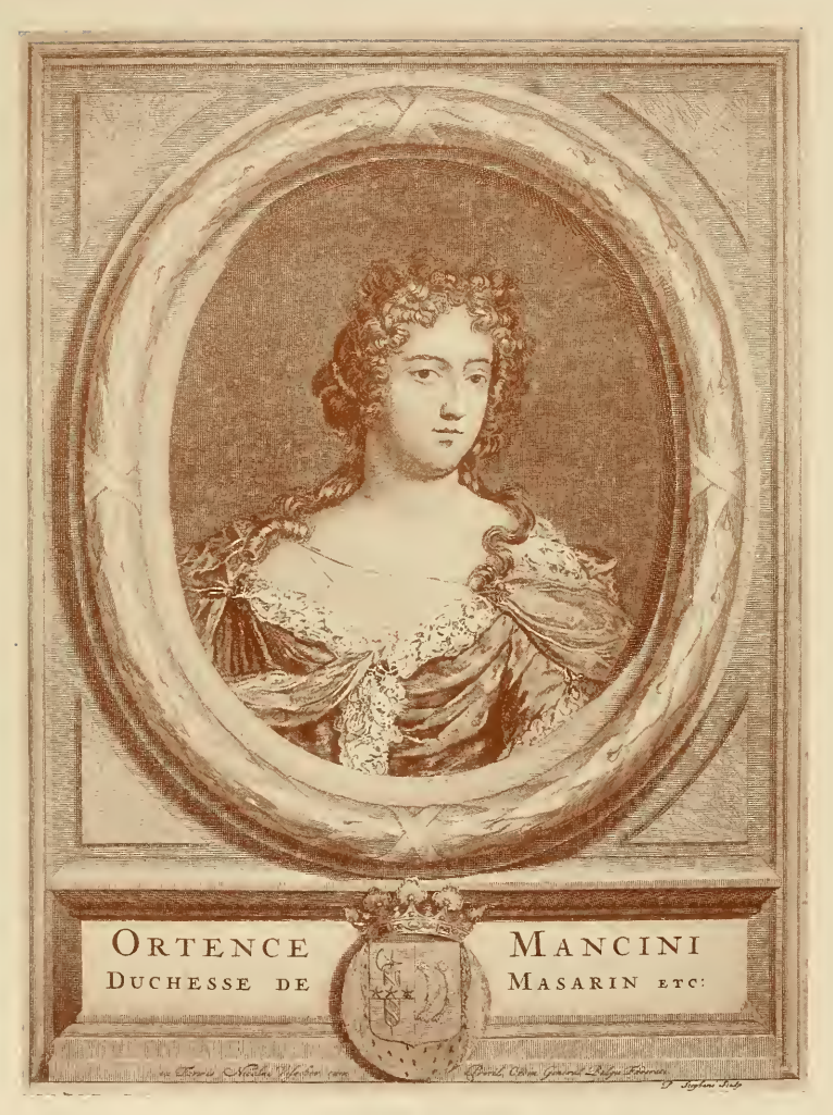
HORTENSE MANCINI From an old copper print