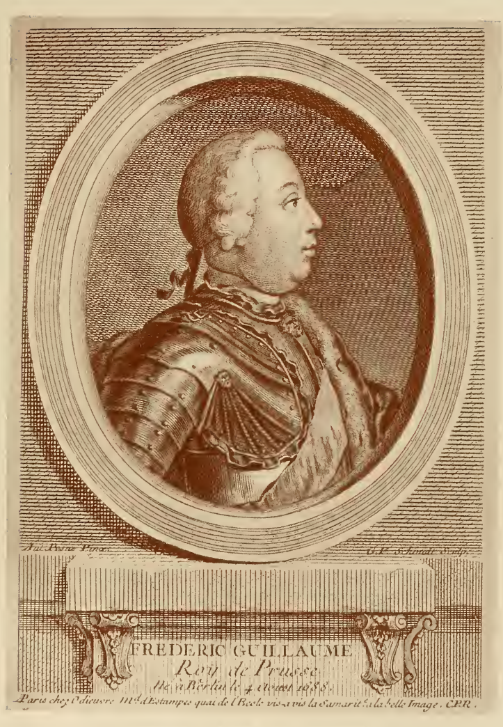
FREDERICK WILLIAM KING OF PRUSSIA From an engraving by G. F. Schmidt