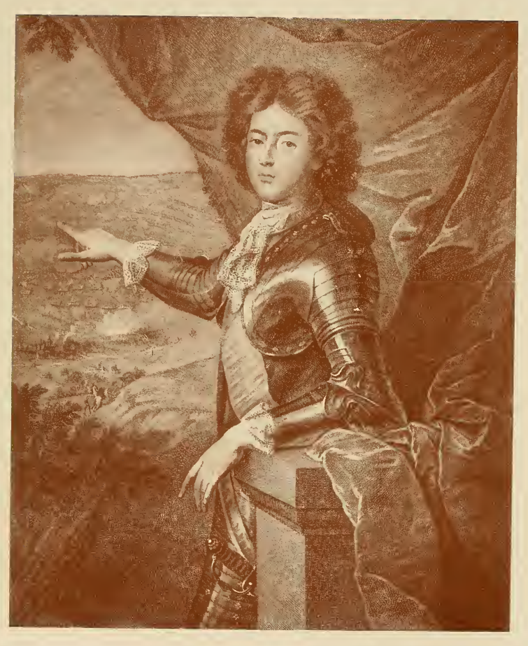
DUC DU MAINE From an old copper print