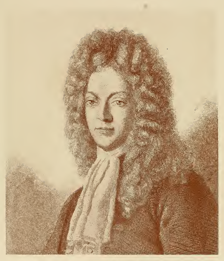
NICOLAS DE MALEZIEU From an old copper print