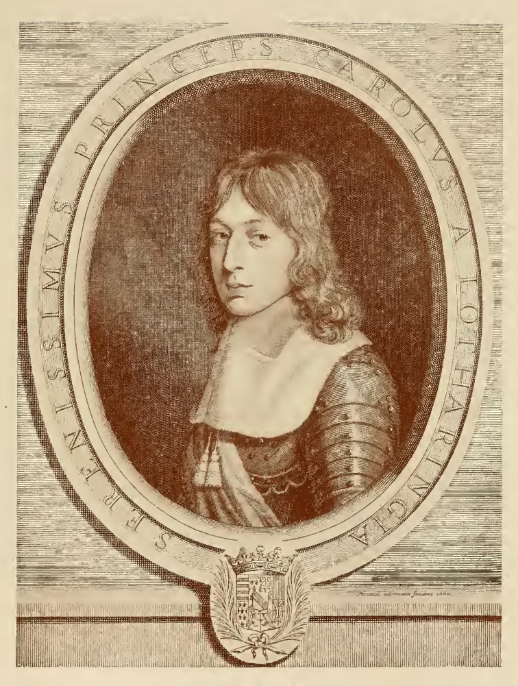
PRINCE CHARLES OF LORRAINE From an old copper print