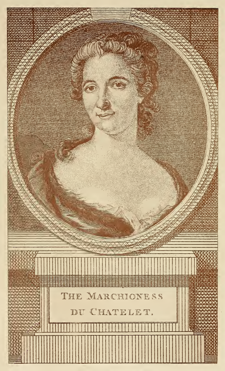
MARCHIONESS DU CHÂTELET From an old copper print