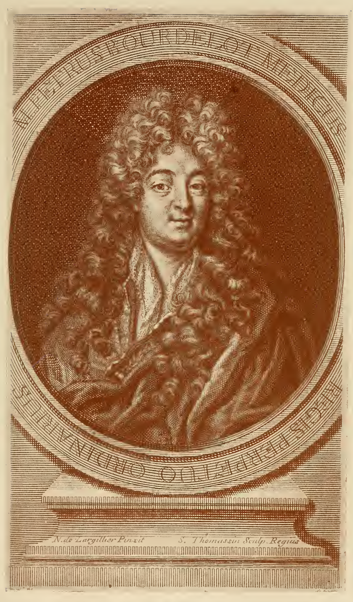
ABBÉ BOURDELOT After the painting by N. de Largillier