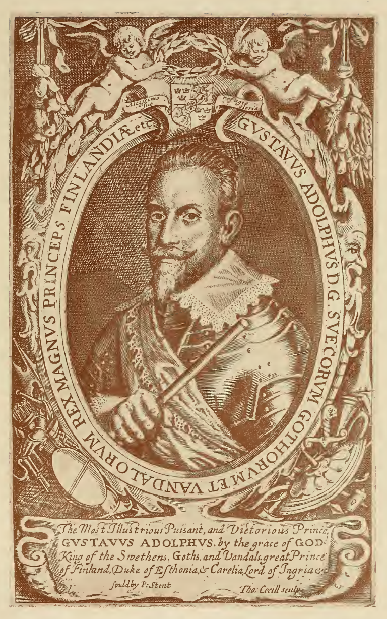
GUSTAVUS ADOLPHUS From an old copper print