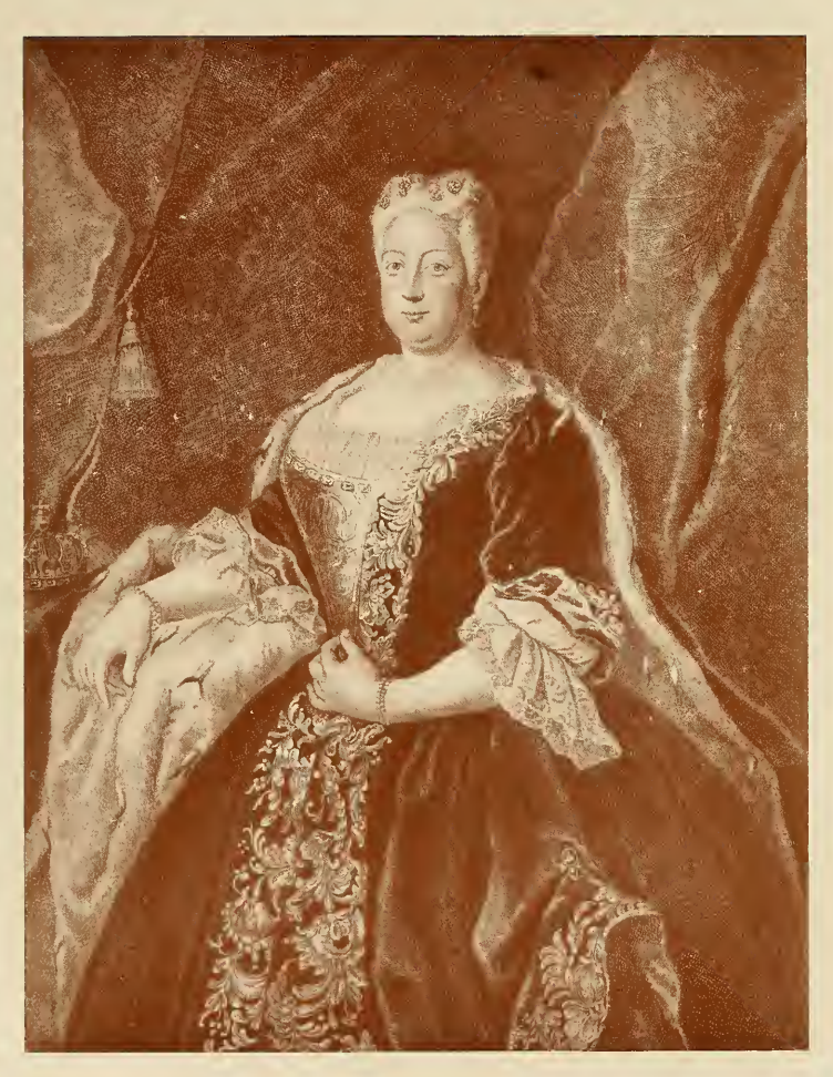
SOPHIA DOROTHEA QUEEN OF PRUSSIA From an old copper print