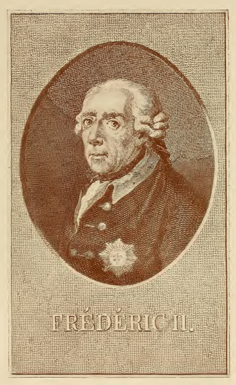
FREDERICK THE GREAT From an old copper print